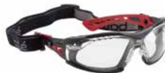
RUSHPFSPSI (Rush+ clear with foam & strap)