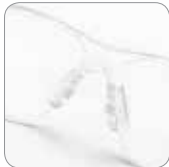
Non-slip adjustable bridge