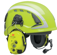
MT15H7P3EWS6 / MT15H7P3EWS6-111