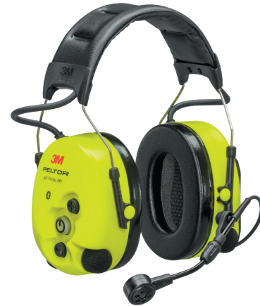
MT15H7AWS6 / MT15H7AWS6-111